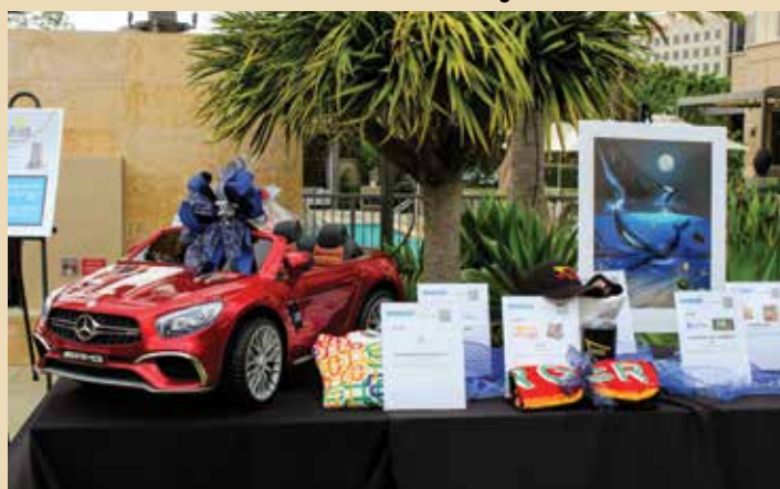
Fun raffle prizes from donors, In-n-Out, Fletcher Jones Newport and Wyland Foundation from last year's gala